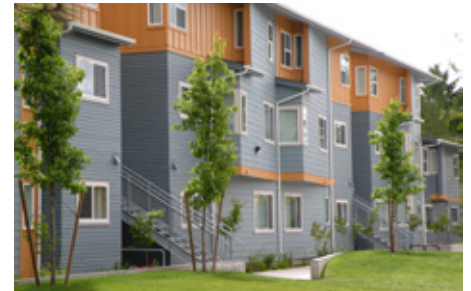
Villa de San Juan Bautista | Farmworker Housing