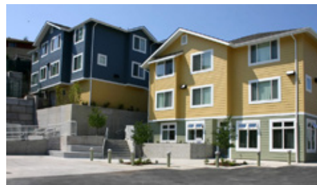
Santa Teresita Del Niño Jesus | Family Housing