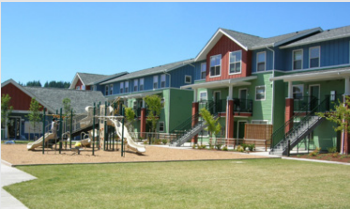
Casa de la Familia Santa | Farmworker Housing