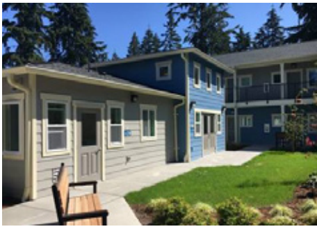
Sebastian Place | Veteran Housing