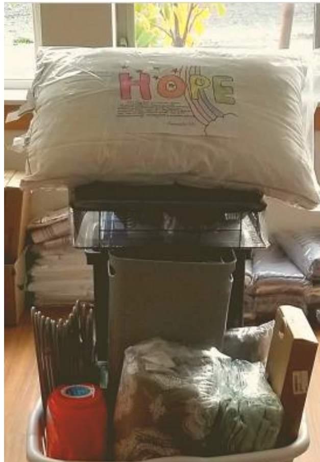
Welcome Home Basket for new residents, 2020