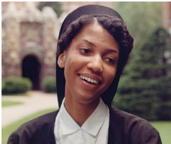
Sister Thea Bowman.