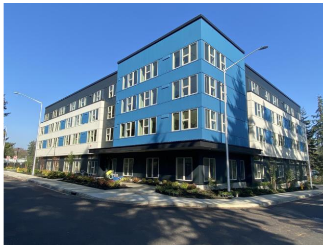
Thea Bowman Apartments, 2020

In collaboration with Department of Veterans Affairs (VA), it was decided that the new project, the first permanent supportive housing program in Kent, would have a portion of units specifically designated for veterans. Funding was secured in partnership with the Washington State Housing Trust Fund, Raymond James Financial (through the purchase of low-income housing tax credits) and with the help of Section 8 housing vouchers provided by King County and VASH vouchers through the VA and HUD. Construction of the Thea Bowman Apartments began in 2019 and was completed in mid-2020. While the process moved at a slower rate due to safety protocols associated with the COVID-19 pandemic, Governor Inslee's March 2020 determination that affordable and permanent supportive housing constitute essential services allowed construction to continue even when other developments were halted.