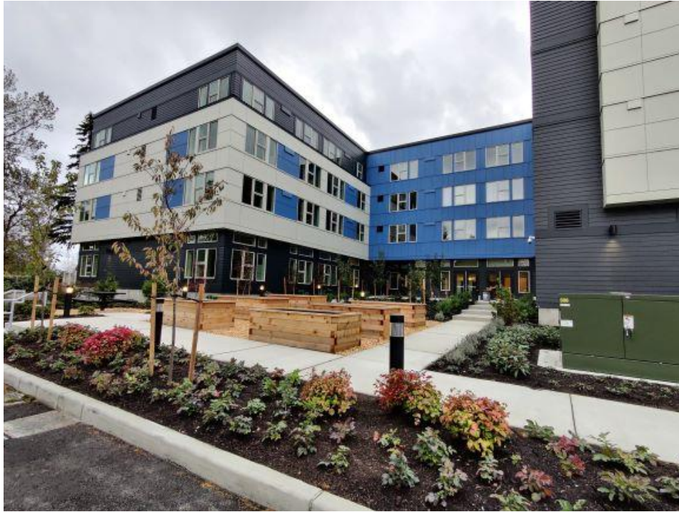
Thea Bowman Apartments, 2020

with the goal of meeting each residents' unique needs through effective communication that is adaptable, stability-focused, and trauma-informed.